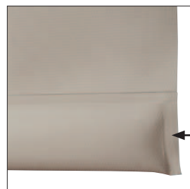
Shade hem bar

For additional technical support, call 574-262-0954.